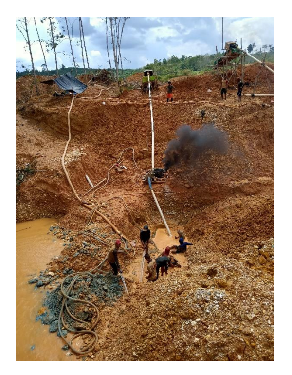
Figure 3. Traditional machine in Sarolangun ASGM

Since 2000, the local communities of mining engineering have improved using traditional machine and hydraulic system. This technology is proven to produce more gold than the others traditional technologies. The conventional machine is used as an alluvial exploitation tool. Besides that, to determine areas that have potential gold reserves, also use a conventional machine such as hydraulic and wallet ( Dompeng in traditional term). The traditional machine commonly used in the Limun sub-district is a traditional machine about 4 to 6 inches.